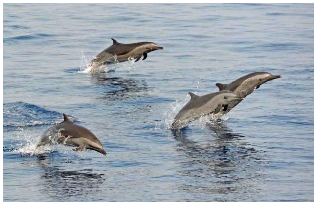
Spotted Dolphins (Chas Anderson)

We plan to board 'MV Mermaid II' in the early afternoon, at Benoa port located in the south of the island, and from there we begin our journey east. The exact itinerary for this cruise will be kept flexible to take account of such factors as the weather and wildlife sightings, benefiting from the unrivalled experience of Chas Anderson and his crew. As we travel from island to island we will stop to enjoy the scenery, cetaceans and other wildlife we meet along the way. Flying fish skitter away over the water's surface, whilst high overhead menacing flocks of Greater and Lesser Frigatebirds endlessly circle, occasionally joined by their rare Christmas Island cousin, while the beautiful Red-tailed and White-tailed Tropicbirds are also likely. We will travel by day and anchor early each evening in a sheltered spot to allow plenty of time for snorkelling and to appreciate the wonderful diversity of underwater life that abounds here, including, we hope, Manta Rays! Then,