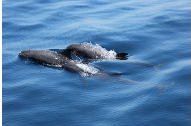
Melon-headed Whales (Sara Frost)

One of the main focuses of this cruise will be the tropical cetaceans that live in these warm waters, especially those in and around Komodo National Park. Species that we are likely to encounter include False Killer Whale and Melon-headed Whale, plus Spinner, Spotted, Risso's and Fraser's Dolphins. Other possible species include Blue Whale, Cuvier's Beaked Whale, Dwarf Sperm Whale, Rough-toothed Dolphin and we will be keeping a sharp look out for the little-known Eden's Whale, a pending split from Bryde's Whale.