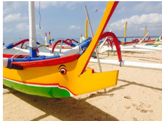
Beach in Bali (Sara Frost)

Following a change of aircraft, we are due to arrive on the palm-fringed island of Bali in the late afternoon, transferring from the airport to a beachfront hotel for our first night in the Indonesian archipelago. Bali is located at the westernmost end of the Lesser Sunda Islands, between Lombok and Java, and is just as exotic and beautiful as you would imagine! This evening will be a chance to relax and unwind after the long journey, or perhaps enjoy a first swim or snorkel in the warm sea.