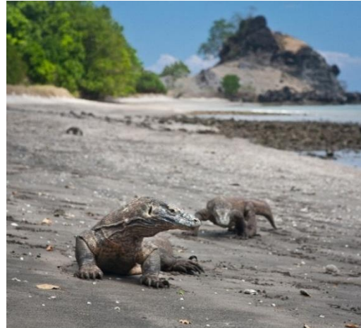
Komodo National Park (left) and Komodo Dragons (right)