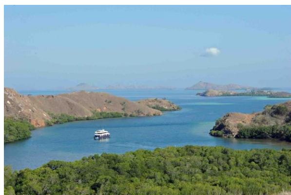
Komodo Dragon and MV Mermaid off Rinca