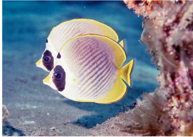
Indonesian butterfly fish (Chas Anderson)

Bali and Komodo are just two of the 17,000 islands that make up the archipelago of Indonesia, the largest in the world. This is a country born of fire, a region shaped over the millennia by huge tectonic forces and the slow, but inexorable, collision of the Indo-Australian and Eurasian Plates. From the tropical paradise of Bali a great arc of volcanic islands stretches to the east including Lombok, Sumbawa, Komodo and Flores. Some of these are now quiet, the heat from beneath having subsided long ago, whilst others still retain their internal furnace and awaken from time to time. All, however, lie in warm tropical seas, home to the most diverse marine-life anywhere in the world with over 3,500 species of fish (more than enough to keep the keenest snorkeller enthralled!) and a wonderful array of tropical whales and dolphins. On the islands themselves, an equally fascinating variety of birds and other wildlife may be found, including their most infamous inhabitant of all, the formidable Komodo Dragon, the largest species of lizard left on Earth! The wildlife that lives on this archipelago is of particular interest to the naturalist as it is here that the Asian fauna gives way to the Australasian wildlife, the boundary being marked by the famous 'Wallace Line' between Bali and Lombok.